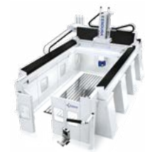
ENDURA® 900LINEAR GANTRY MILLING MACHINE