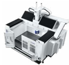
ENDURA® 900LINEAR COMPACT GANTRY MILLING MACHINE