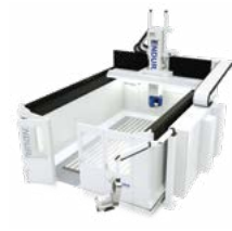
ENDURA® 600LINEAR GANTRY MILLING MACHINE