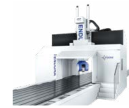
ENDURA® PRO LINEAR LONG BED GANTRY MILLING MACHINE