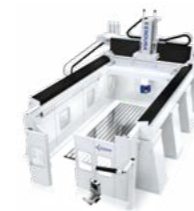
ENDURA® 900LINEAR GANTRY MILLING MACHINE