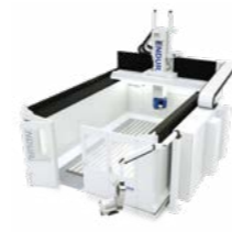
ENDURA® 600LINEAR GANTRY MILLING MACHINE