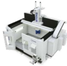
ENDURA® 700LINEAR COMPACT GANTRY MILLING MACHINE