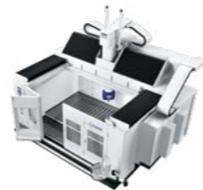
ENDURA® 900LINEAR COMPACT GANTRY MILLING MACHINE