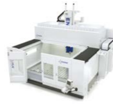
ENDURA® 7000LINEAR COMPACT GANTRY MILLING MACHINE