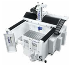
ENDURA® 400LINEAR COMPACT GANTRY MILLING MACHINE